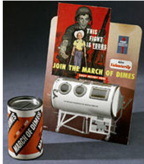
March of Dimes coin banks. These banks were placed near the cash registers of retail merchants, restaurants, and theaters to receive donations for the fight against polio.