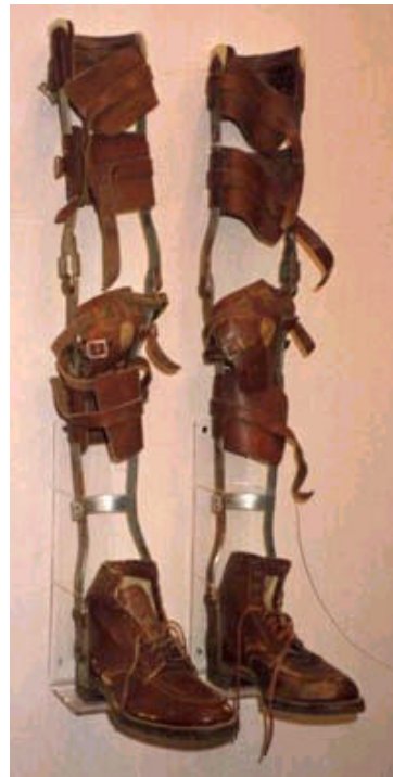
Leg braces, common in the era of polio epidemics, and still used by some polio survivors to this day.