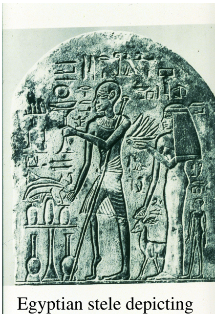
Egyptian stele depicting Siptah, an Egyptian Pharaoh, who many historians believe had polio. Notice his atrophied leg and his walking stick.