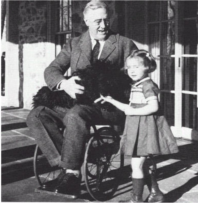
President Franklin Delano Roosevelt This is the only known photograph of President Roosevelt in a wheelchair.