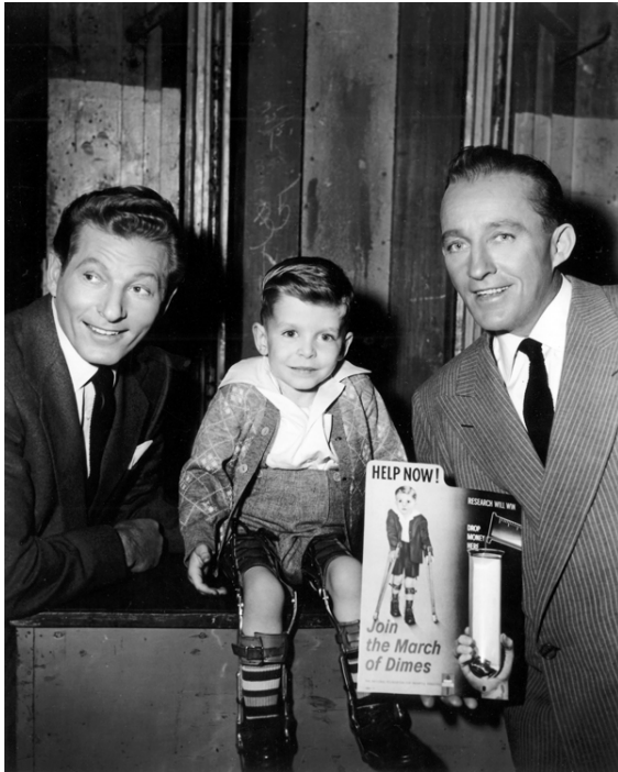
Danny Kaye and Bing Crosby

Hollywood and the Sports World Helped in the Fight Against Polio