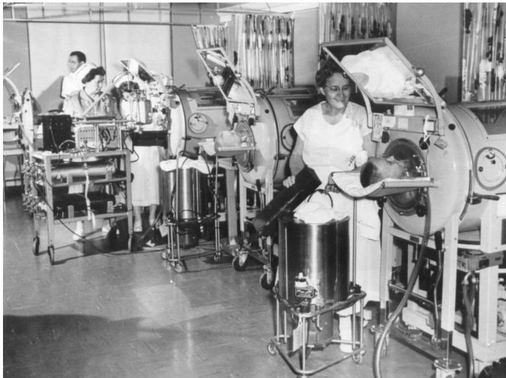
Respiratory Polio Ward Rancho Los Amigos National Rehabilitation Center , Downey, California